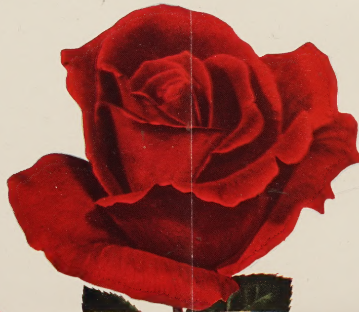
NOCTURNE (Pat. 713)